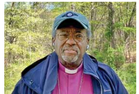
Presiding bishop leads "Habits of Grace" series.