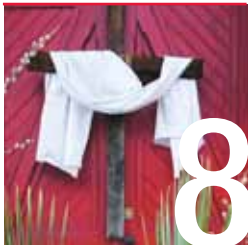
FEATURE Photo gallery: Easter and Holy Week