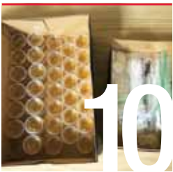
FEATURE Churches debate benefits of virtual Eucharist