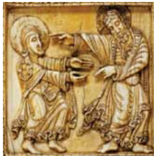
"Noli me Tangere" Léon, Spain, ca. 1115-20. Ivory, traces of gilding.

Despite the power and beauty of the virtual Lent and Holy week liturgies and the successful Zoom meetings and gatherings, they all remain substitutes for the real thing. I miss the tangibility of being in church: listening to the organ prelude before the service begins; joining my voice with others in singing hymns; smelling the incense that always makes me cough a little; eating and drinking the Body and Blood; shaking a hand; seeing and speaking with my fellow parishioners.