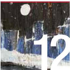
ARTS Artworks help to lift spirits during crisis

NON-PROFIT ORG. US POSTAGE PAID PERMIT #1239 Bellmawr NJ